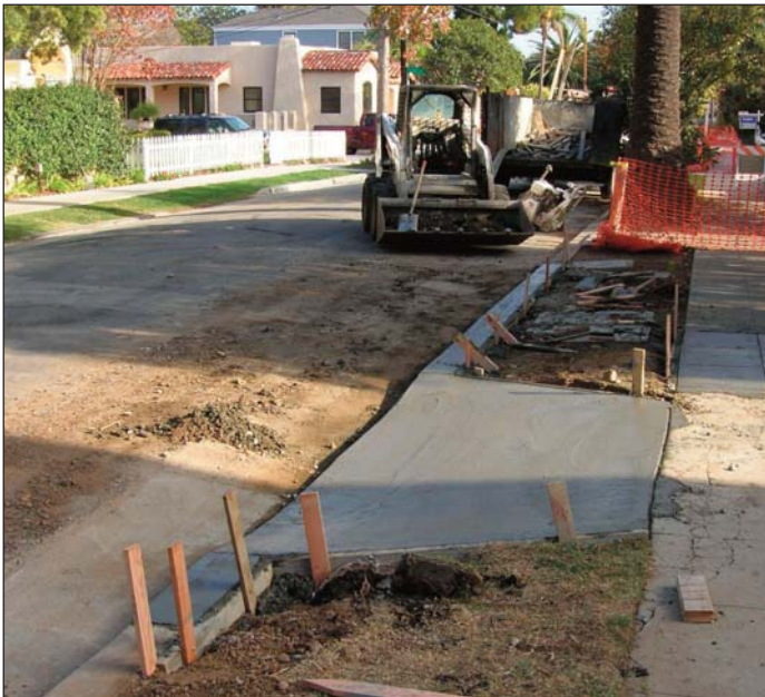
Curb and sidewalk repair are part of our contractor's trenching activities.

You have likely have seen KTA Construction digging trenches in the streets. Trench work is approximately 35% completed in Project Block 2E. We ask for your patience as they complete this work, as it can be disruptive and distracting. Approximately two weeks prior to the start of the trench work on your property and in the street, you will receive a door hanger with the trenching contractor's name and phone number on it. If you have any questions or concerns about the work, please do not hesitate to contact the contractor.